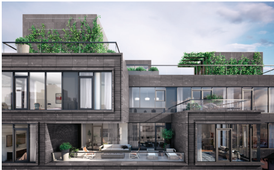
Penthouse decks feature floor-to-ceiling windows.