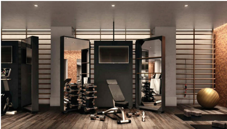
Yes, there's a gym!