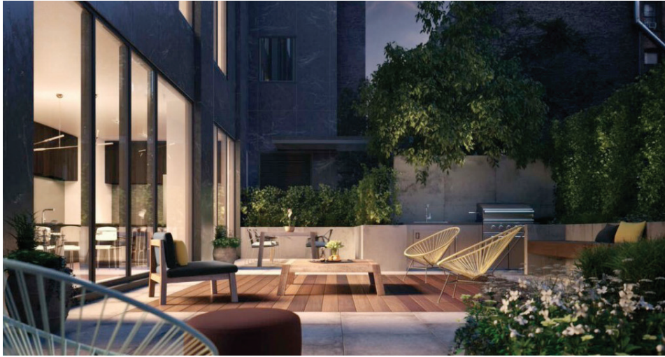
The Flynn's garden apartments feature landscaping, built-in benches and outdoor kitchenette.