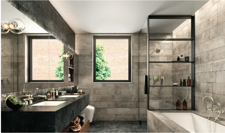
Limestone dominates The Flynn bathroom.