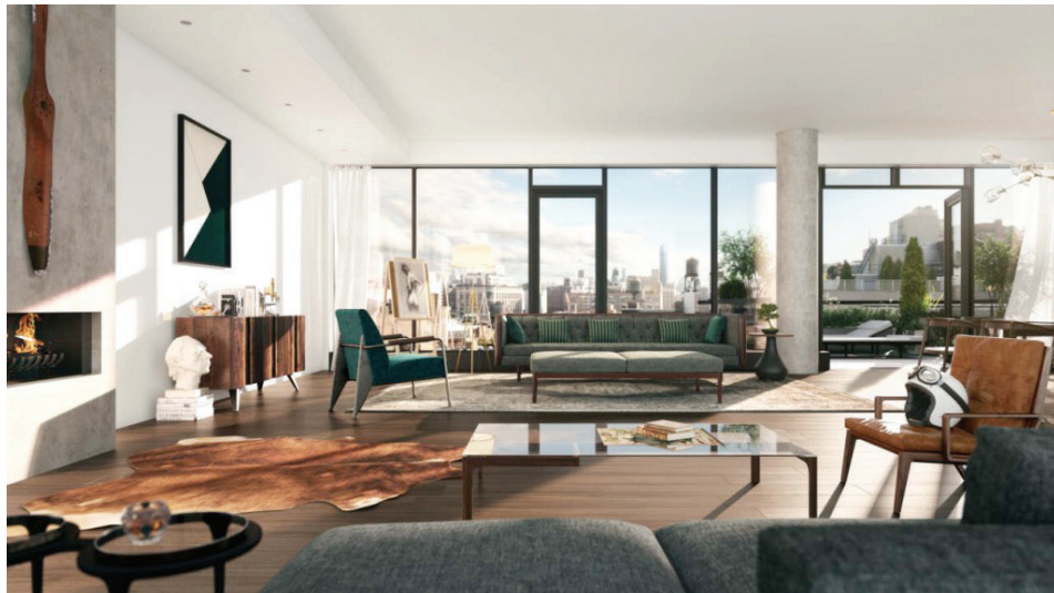
The penthouse's great room offers high ceilings, walnut flooring and exposed concrete columns.