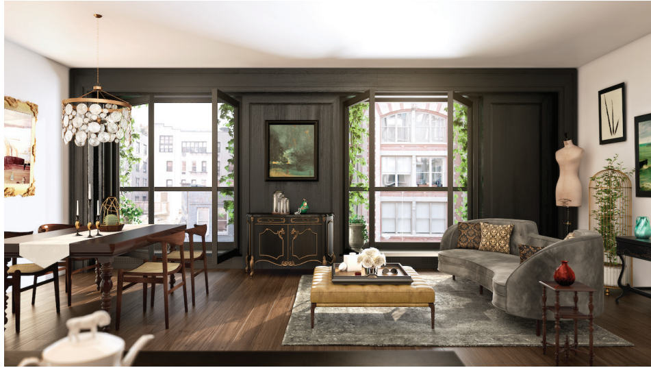
Living rooms feature millwork wood paneling, Juliet balconies and walnut flooring.